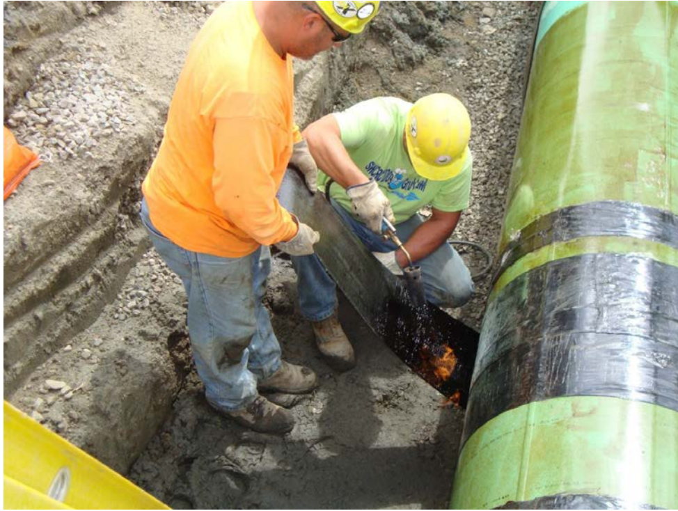
Figure 7: Heating the adhesive before applying the tape to the surface (Section 4.4)