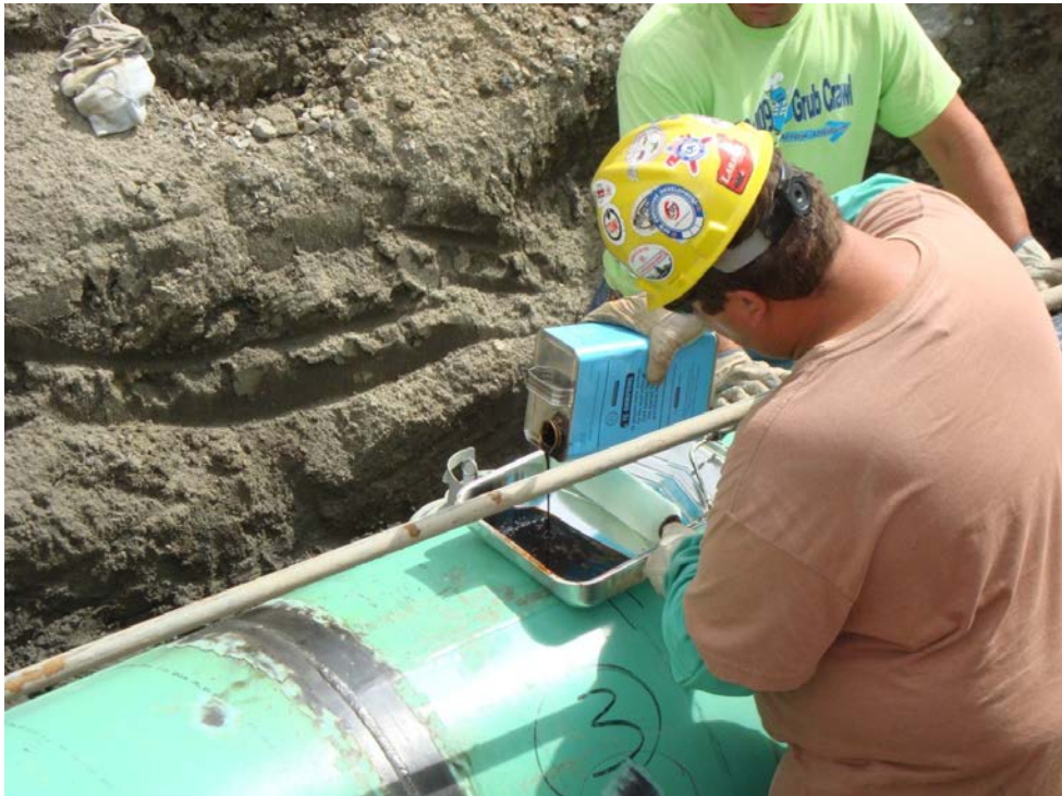
Figure 5: Preheat the pipe and apply primer (Section 4.1, 4.2)