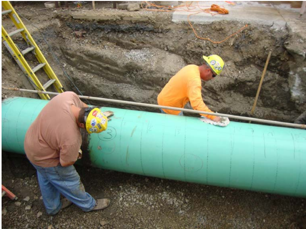
Figure 3: Cleaning the Surface (Section 3.2)