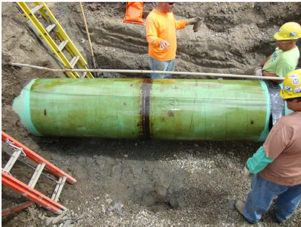
Figure 6: Primer application complete and allowed to dry (Section 4.2)