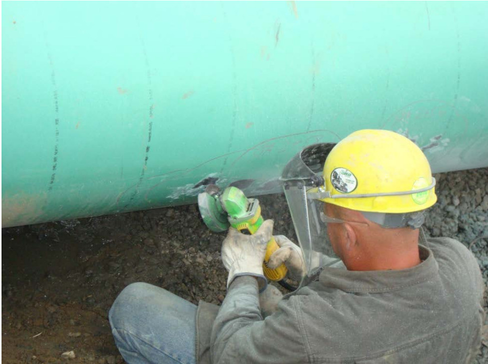
Figure 1: Remove all loose in disbonded coating (Section 3.1)