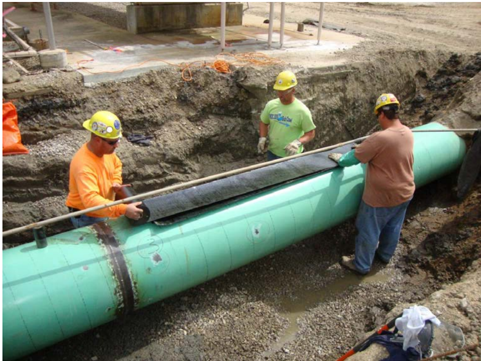
Figure 4: Precutting tape for cigarette wrap (Section 4.5.2)