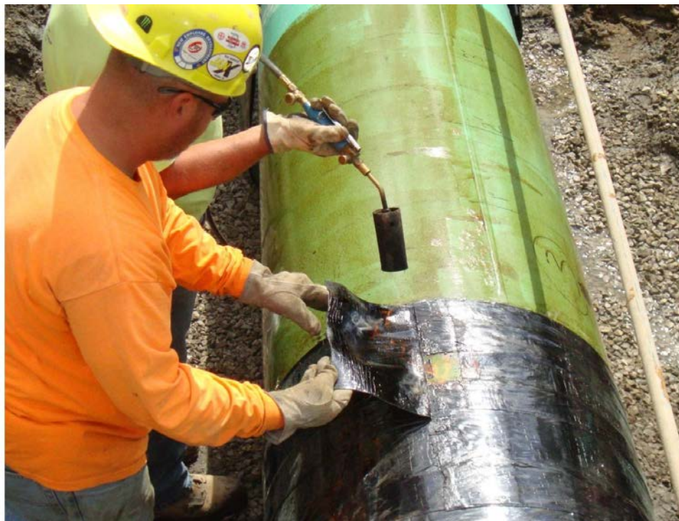
Figure 8: Heating last part of a precut piece, the piece will end facing down at the 1 o'clock position (Section 4.4)